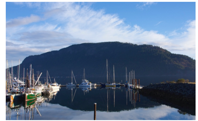
Come and sit by the shore and watch the sun set over beautiful Cowichan Bay

NOTE: When contacting the Oceanfront Suites at Cowichan Bay please identify yourselves as attending the Fairbridge Reunion for September 15 - 16, 2017.