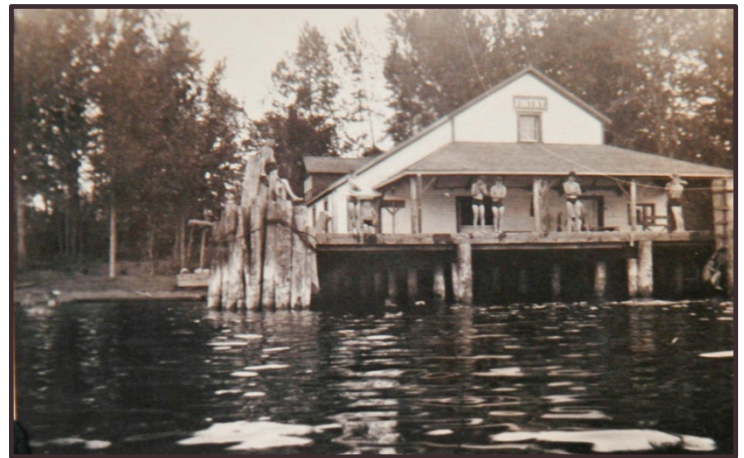
Above - the Packinghouse.

The Fintry Fairbridge Training Farm circa 1939. Okanagan Valley, BC.