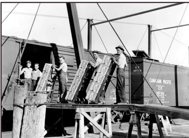
Left, boys packing apples into the train car. Below - the tug towing the barge with the loaded train car to the train-yard, either in Vernon or Kelowna.