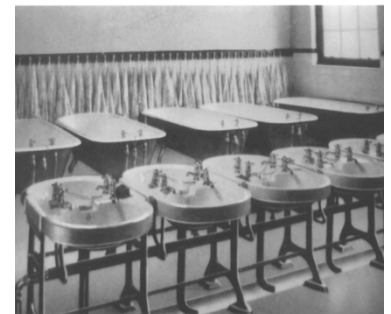
the "Splash House"