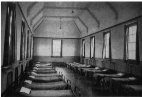
The Girl's Dormitory -

Please contact Val to find out more: valhart1@googlemail.com 0121 689 2584