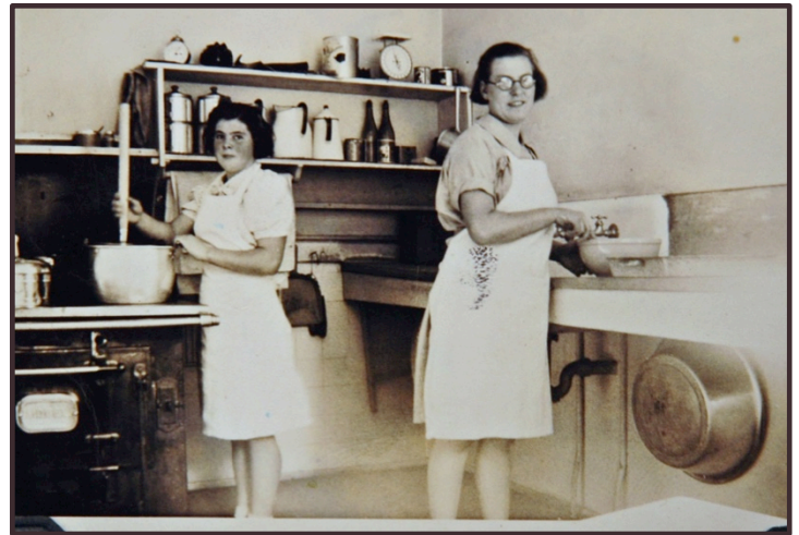
12-14 boys would do the farm work and two girls were sent to do the domestic work.

The Fintry Fairbridge Training Farm circa 1939. Okanagan Valley, BC.