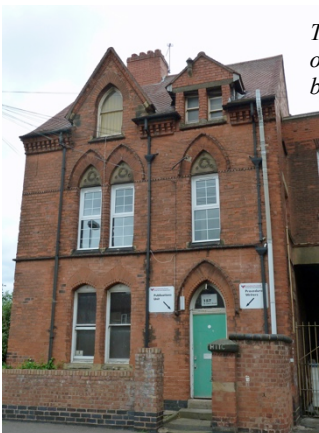
The first Middlemore Emigration Home for boys was opened in 1872 at 157 St. Luke's Road. It stands today, but is also in danger of being demolished.