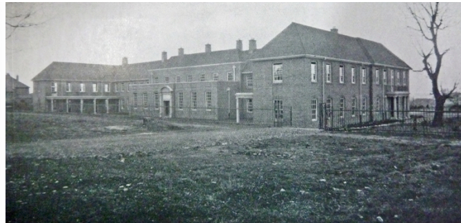
THE NEW MIDDLEMORE EMIGRATION HOMES IN WEOLEY PARK ROAD, SELLY OAK.